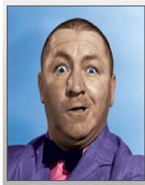
The Three Stooges!