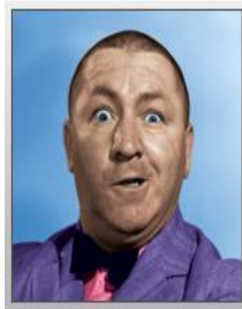
The Three Stooges!